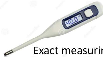
Exact measuring (temperature)!