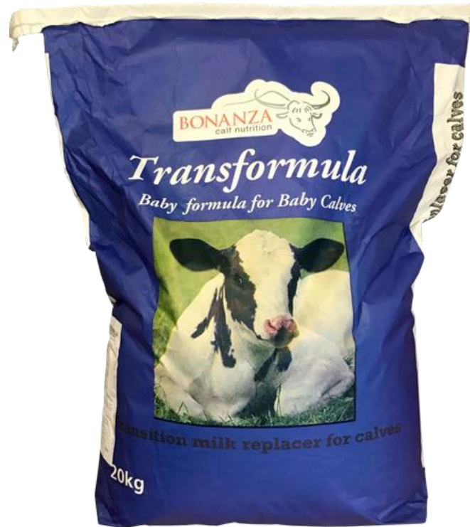
Calf Milk Replacer (CMR)