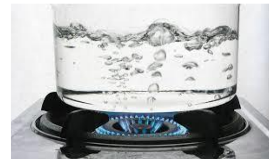
Use clean warm water