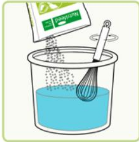
Add 1 kg CMR powder