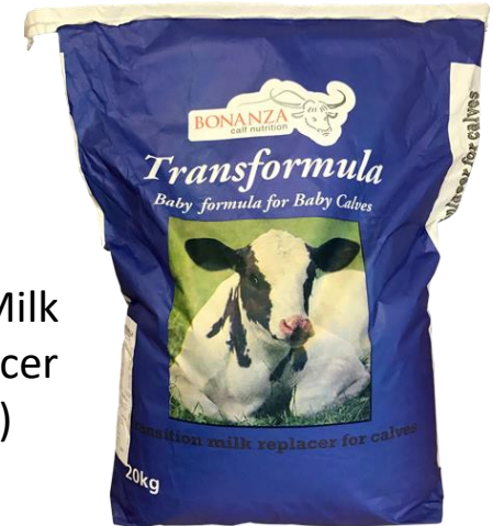
Calf Milk Replacer (CMR)