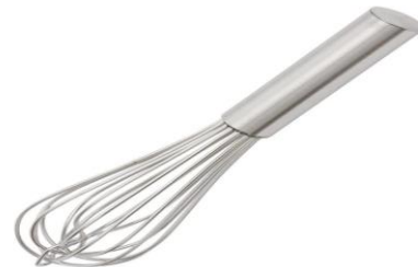
5 minutes stirring