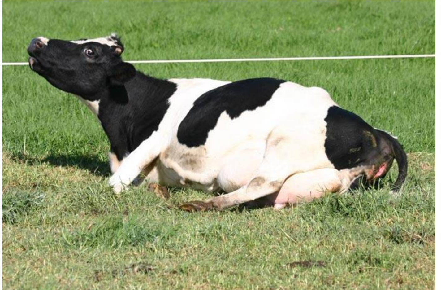
Visible abdominal contractions