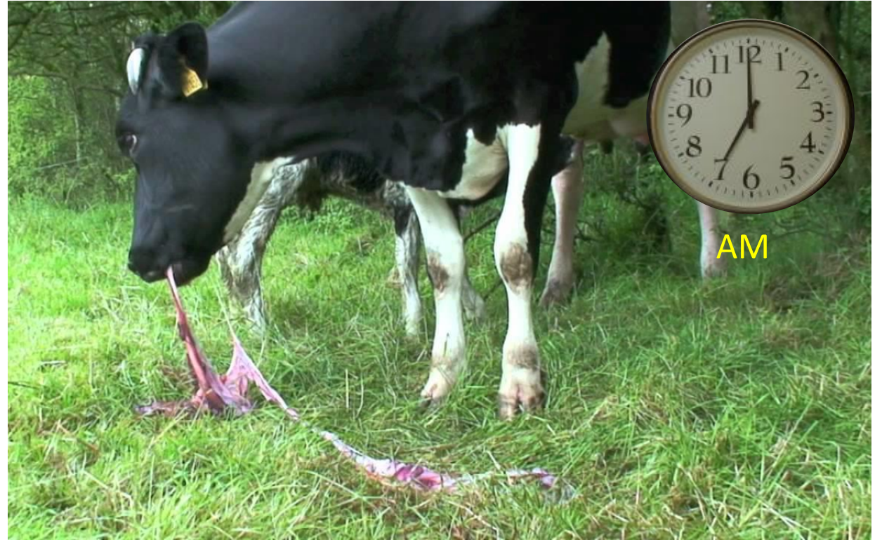
Cow eating placenta