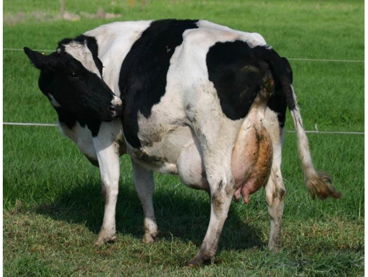
Kicking and licking at her side