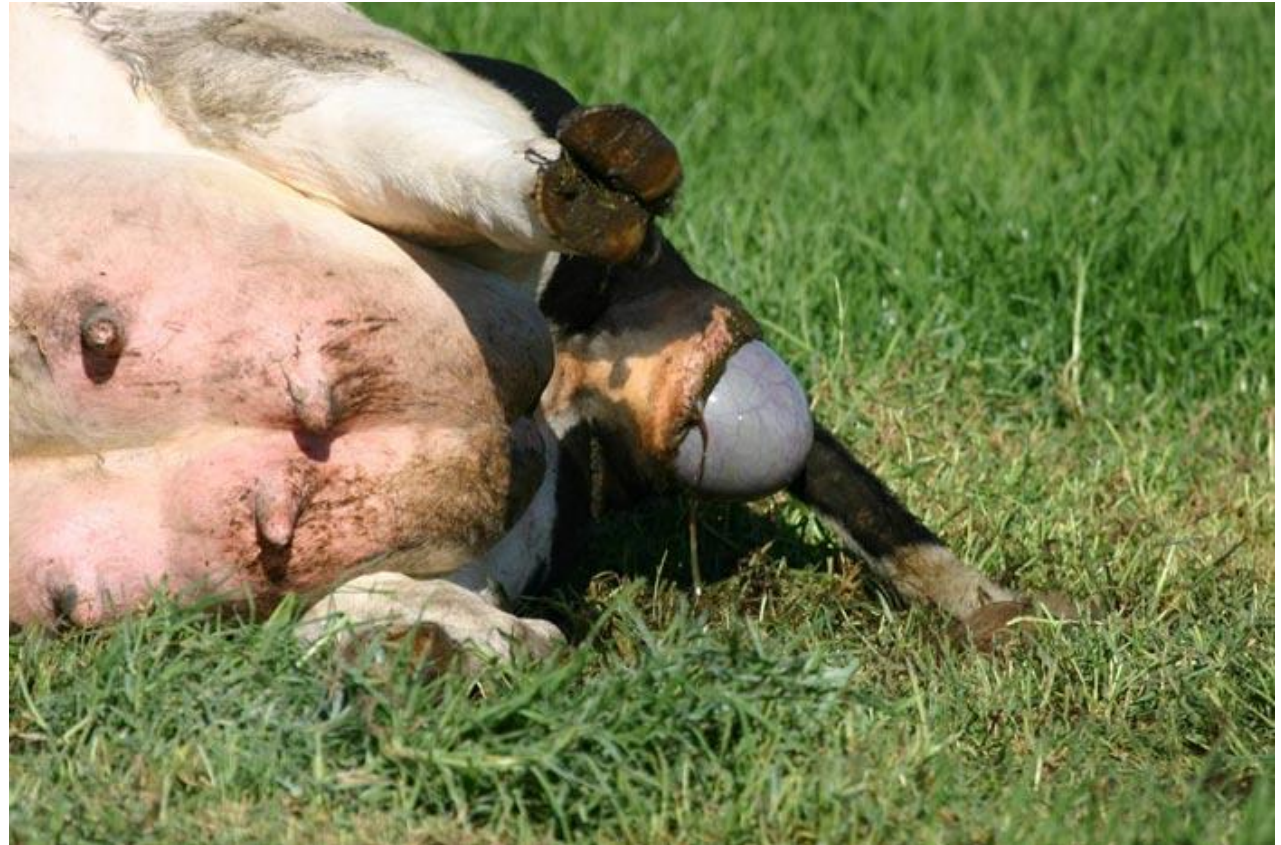
Water bag protruding

https://www.youtube.com/watch?v=1Mtxft-8Pk4